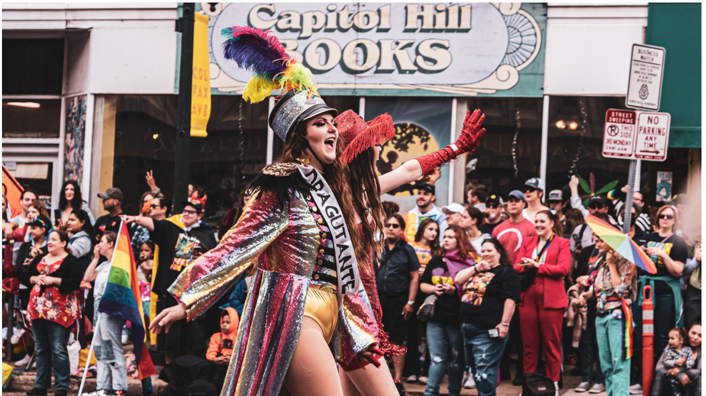
Denver Pride Parade, 2022.